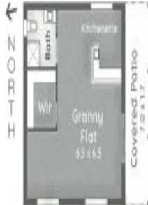
FLOOR PLAN Granny Flat