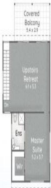
FLOOR PLAN First Floor