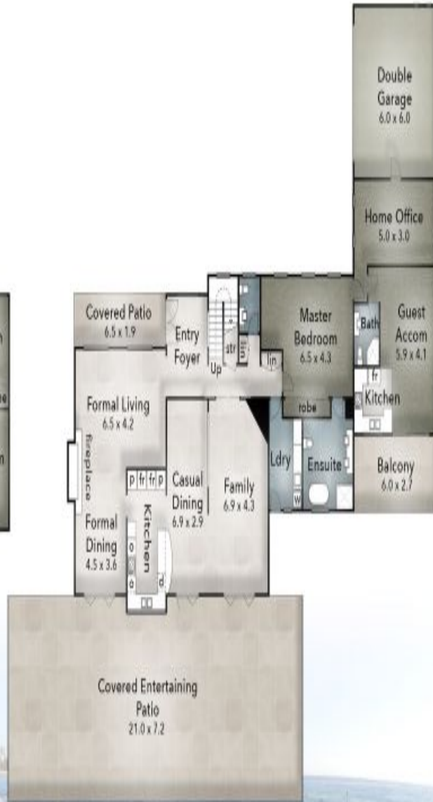
FLOOR PLAN // Ground Floor