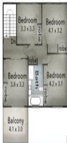
FLOOR PLAN // First Floor