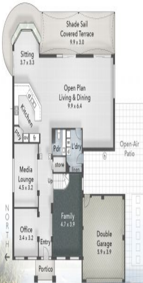
// FLOOR PLAN Ground Floor - 2.6m Ceiling