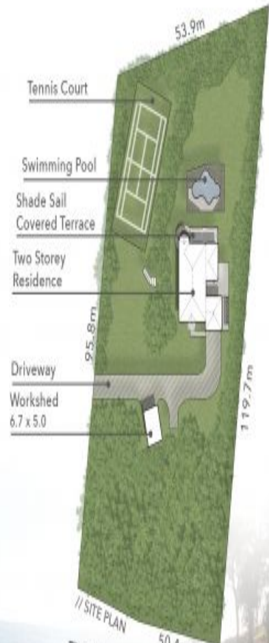
// SITE PLAN THE PANORAMA

Plans shown are only indicative of layout. Dimensions are approximate.